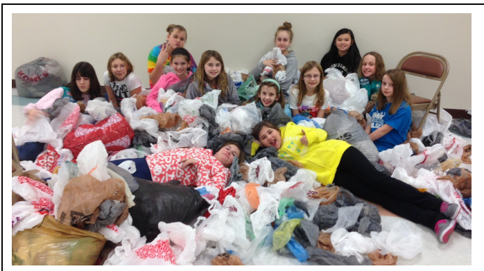
Girl Scouts in New Lenox on a bag-sorting afternoon!

The challenge is scheduled to end on Earth Day, April 22. As of the end of February, the schools had collected over 450,000 bags. Check back with us to learn which school won the recycled plastic bench.